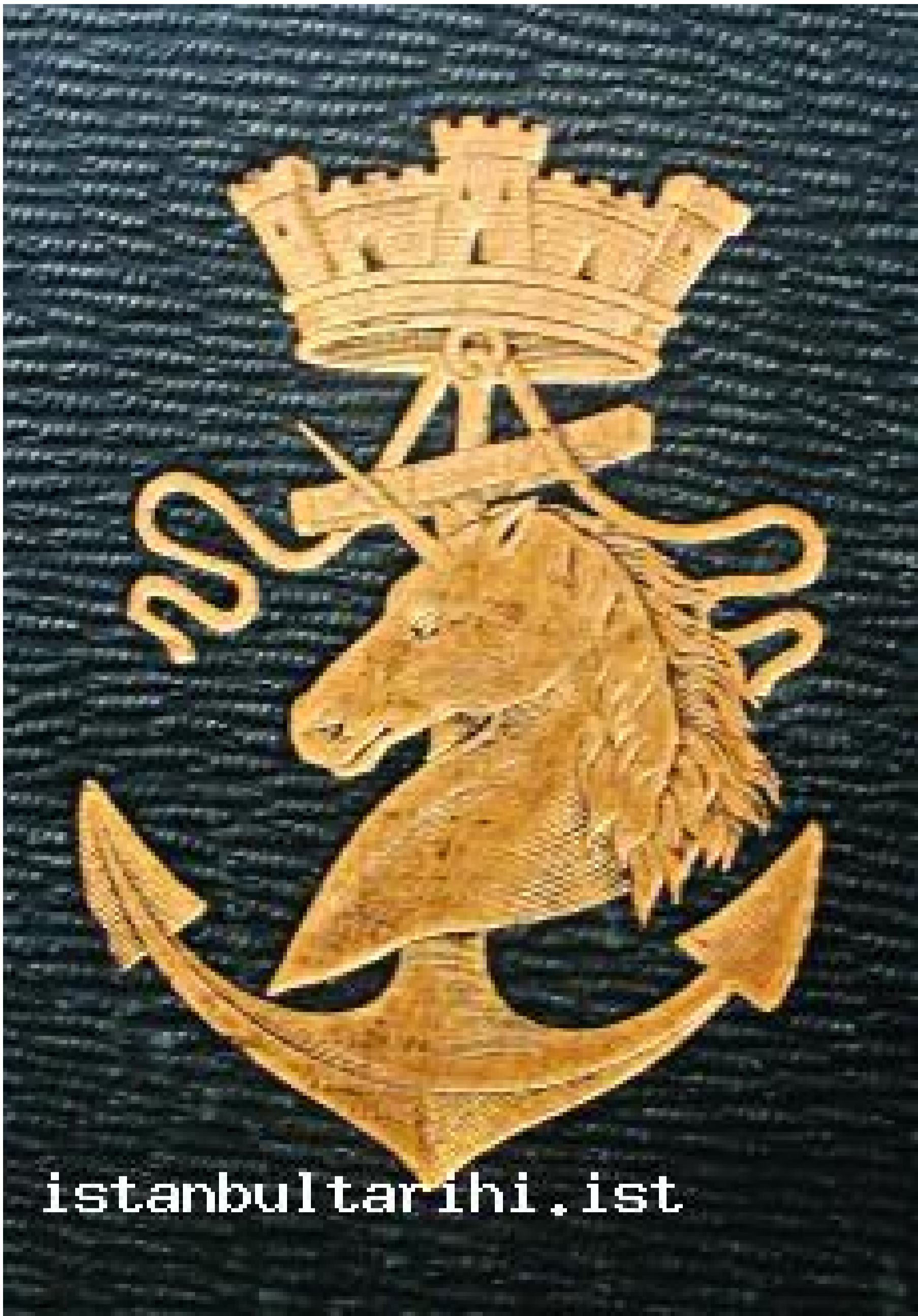
1- The emblem of Messageries

Except for the Le Service Maritime Postal de l'Etat , most of the foreign transportation companies entering Istanbul Port transported post, passengers or commodities. Because the main aim of the Le Service Maritime Postal de l'Etat was to provide a connection between France and Istanbul, it had very few commercial concerns. 5 Rostand et Compagnie , also known as Compagnie des Paquebots à Vapeur du Levant , attempted to meet the commercial transportation needs between Marseille and Istanbul. 6 Having been granted permission by the Ottoman