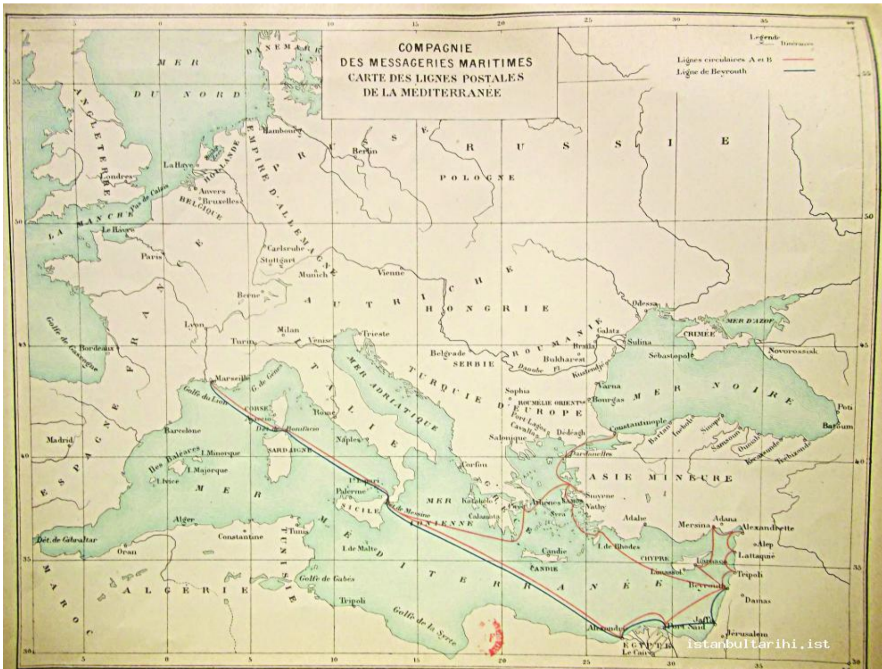
2- The free commercial lines of Messageries Maritimes Ferry Company without subsidies in 1895 in Mediterranean and the Black Sea

government 7 to operate steamboats between Marseille and İzmir and Marseille and Istanbul, the Rostand Company carried out its first voyage with the Hellespont steamboat on July 11, 1846. 8 However, negatively affected by competition with the Austrian Lloyd Company (Lloyd Autrichien), which was using the same route, from the last months of 1846 Rostand Company decreased their voyage frequency from twice a month to once a month. 9