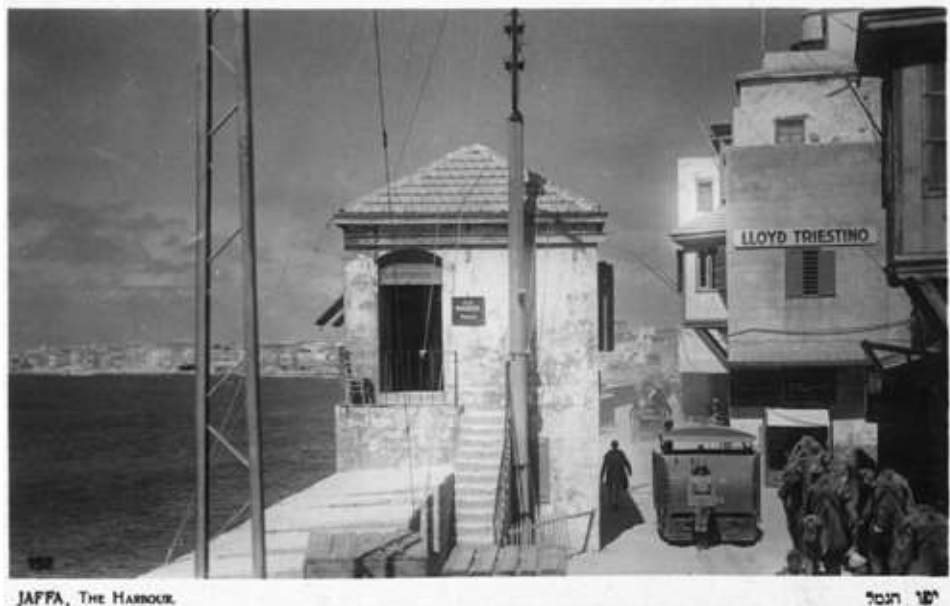
Fig. 4: Lloyd Austriaco offices at Jaffa harbor (postcard from 1910?).