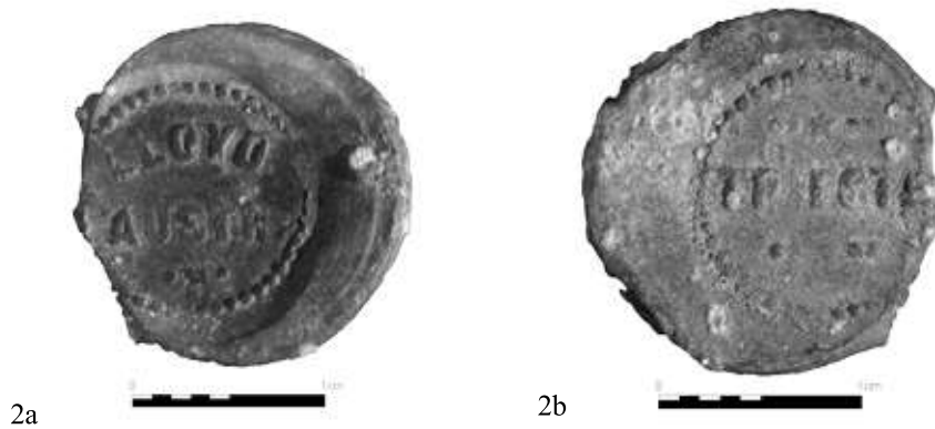
Fig. 2a-b: The seal – obverse and reverse.

shipping company of the time, Austrian Lloyd ( Österreichischer Lloyd, Lloyd Austriaco ) was discovered during salvage excavations in central Jaffa in 2008. 2