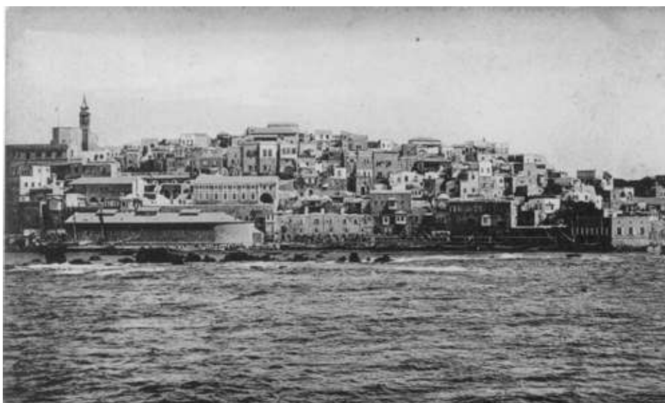
Fig. 5: Jaffa harbor at the turn of the 20th century.