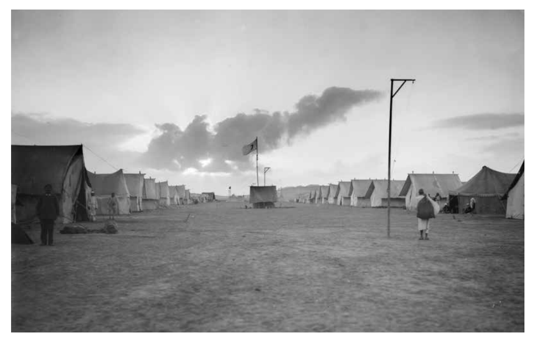
Fig.9 - The Turkish Red Crescent Hospital at Hafir-el-Auja after the American Red Cross departed.

guests, including high-ranking German officers, and gained the moniker of the "American Hotel."<sup>60</sup> Writing in 1918, Dr. Ward describes the strenuous work and concludes that "The soldiers were very grateful. They forgot their hatred of the 'Cross,' their suspicion of the 'dog of a Christian' melted before the sun of human kindness and after a few days they, in a truly oriental fashion, showered blessing on the heads of the nurses and the doctors. All the fatigue, discomfort, the danger, the fierce heat of the desert and the driving sandstorms were forgotten. The battle was won. 'Which one of these- was neighbor to him who fell among thieves? The old Crusader or the modern Crusader?'"<sup>61</sup>