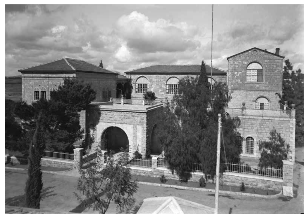
Fig.4 - View of the American Colony.

in advance to take over the project so the colony became the center of operations of the ARC mission. Since 1908 he had also carried the diplomatic office of deputy US consul in Jerusalem. Here again we see the nature of the collaboration between missionaries, humanitarian relief agencies, and governmental entities. He organized the next phase of the operation and accompanied the expedition to Hafir-el-Auja to set up the hospital and became the contact in Jerusalem for resupplies. For weeks the grounds of the Colony had been turned into a warehouse for the tents. The additional freight arriving from Nablus was being dumped into the yard. It reminded him of more glorious days when they would prepare the trips of more celebrated visitors.<sup>47</sup> He mourned that these tents would be lost forever in the hands of the Turks. He writes, "The conquering Turks had come to the Holy Land in tents: it is fitting that they should go out in tents thanks to Thos. Cook & Son."<sup>48</sup>