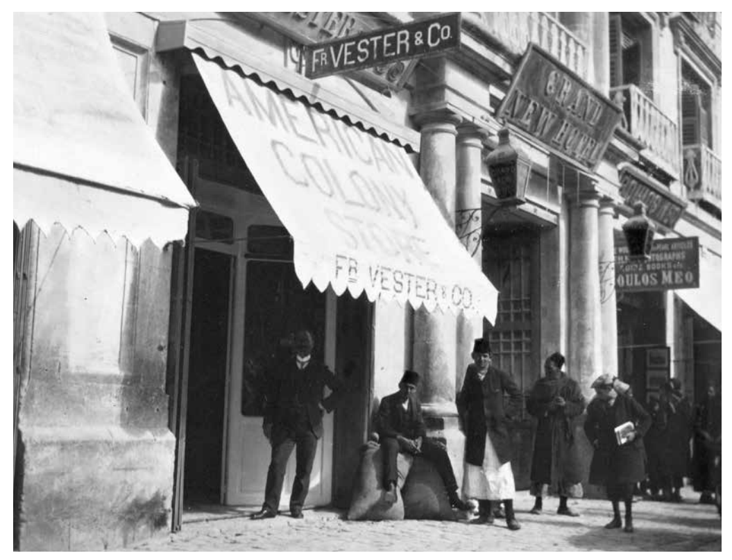
Fig.6 - The American Colony store inside Jaffa Gate.

second group arrived by carriage in one day on 7 February, led through the desert by camelmounted Turkish soldiers. Whiting and additional nurses from the Colony were flown to Hafir.<sup>56</sup> It took three days to set up the functioning hospital consisting of 46 tents "large and small," each tent housing 15 to 23 cots with the patient tents set up in the center in long rows. The main path was known as Wilson Avenue in honor of the honorary president of the ARC. The two flags of the ARC and the Red Crescent were hoisted and Turkish soldiers stood on guard. Seventy-five folding iron bedsteads, and many floor mattresses