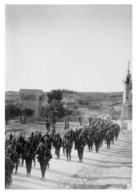
Fig.3 - Turkish soldiers marching past the American Colony on Nablus Road, with the Shaykh Jarrah mosque in the background.

conquer by the sword, to pillage and plunder was so false to Christ's teachings that the Christian Church is not very proud of that chapter of history. Much of the distress, hate and distrust of the Moslems for the Christians even to this day is the result. In December 1914 the green flag of Mohamed was again paraded through the streets of Jerusalem and the bold proclamation of the Holy War made all the Christian world shudder. Would there be a reputation of the same bitter, heartless strife? The answer came when a small band of young men marched through the Damascus Gate and up the Via Dolorosa bearing aloft the Red Cross and the Red Crescent, the Stars and Stripes and the Turkish crescent. On they went under the Ecce Homo arch to the Pool of Bethesda to attend the opening exercises of the Moslem University.<sup>41</sup>